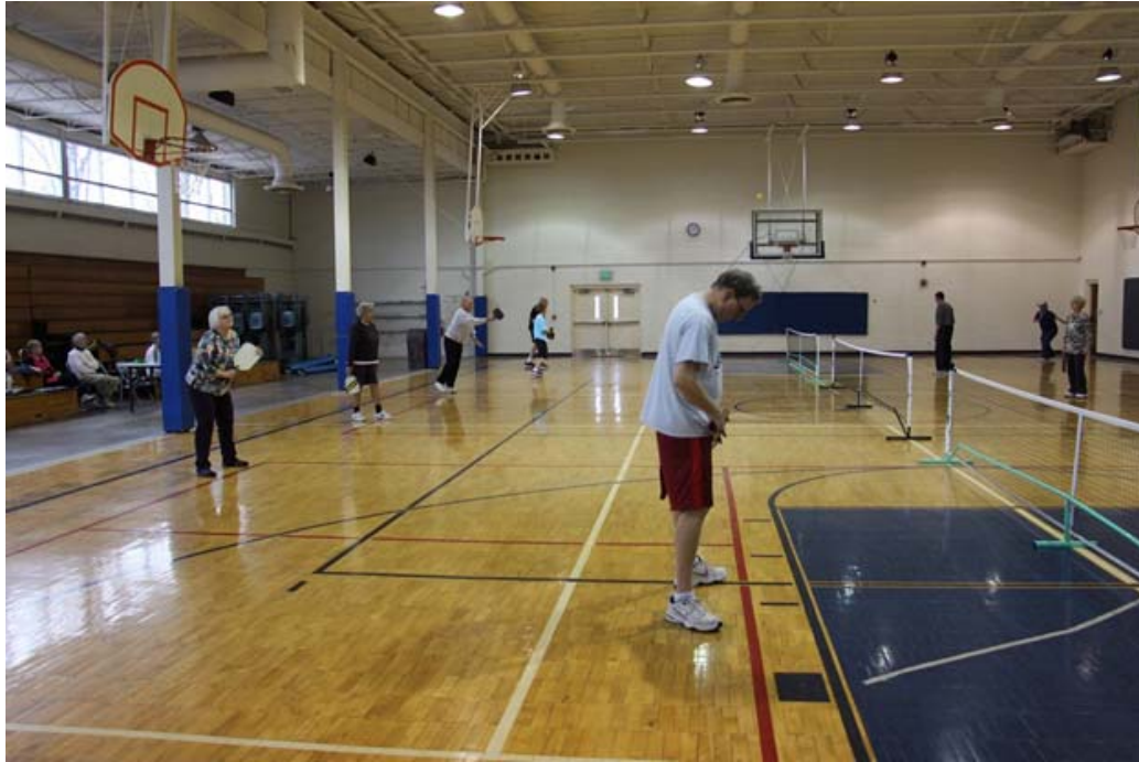
Pickleball players use three courts for doubles play at the Northville Community Center.

For information, call Parks and Rec at 248.349.0203.