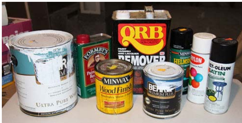
These are some of the many items that can be dropped off at the Hazardous Waste event in April.