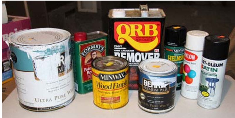
These are some of the many items that can be dropped off at the Hazardous Waste event in April.