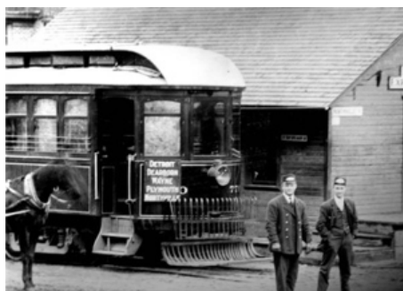
Wed., May 24 Northville Historical Society Lecture Series ~ Metro Detroit Interurban Train System Mill Race Village - Old School Church -