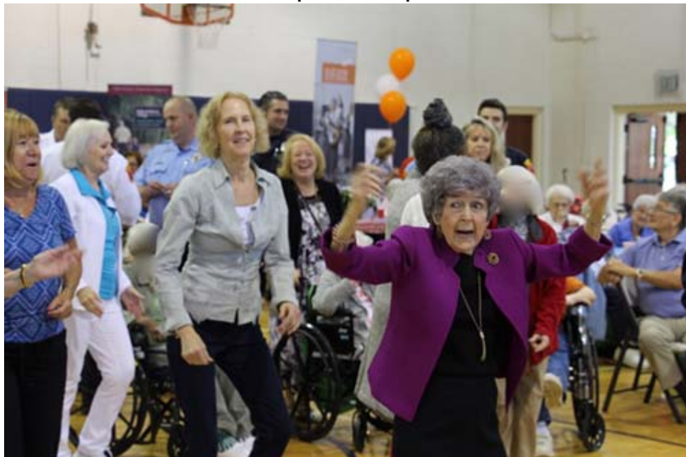
The seniors took to the dance floor and firefighters from the city and township danced with them.