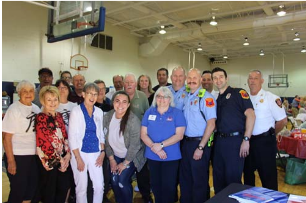
These are the volunteers who helped work or perform at the successful event.