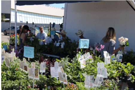
The Farmers' Market has flowers, produce and Michigan-made products and crafts.

Every Thursday through October Farmers' Market 8 a.m. - 3 p.m.