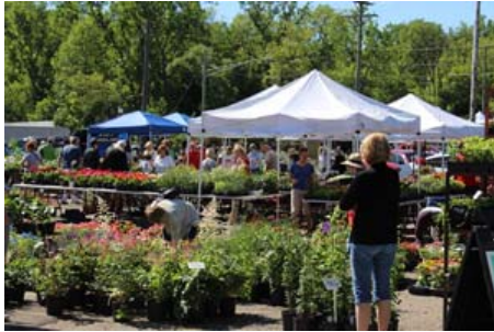
The Farmers' Market has flowers, produce and Michigan-made products and crafts.

Every Thursday through October Farmers' Market 8 a.m. - 3 p.m.