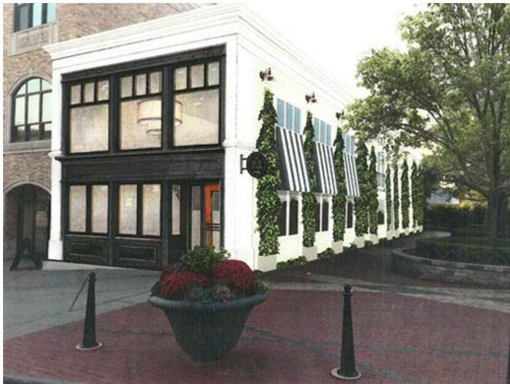
Conceptual drawing of the new restaurant, 160 Main. (Courtesy of A3 Studios)

The second project is a building addition to the library that will convert 800 ft 2 under an overhang on the northeast side of the lower level into an enclosed space for a meeting room and two group study rooms. The architect is Merritt Cieslak Design, PLC, of Farmington.