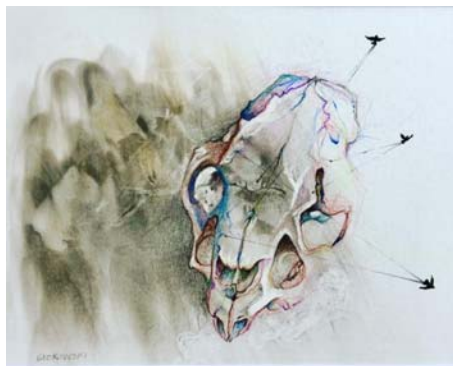
2nd Place: Gail Borowski, A Kiss on the Skull , fumage and colored pencil, 11" x 9"