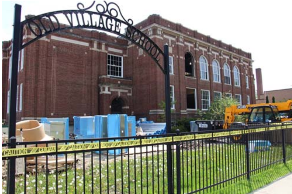
New windows are being installed in the Old Village School Building on Main Street.