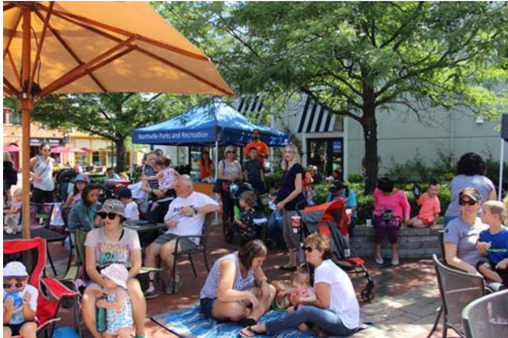
The concert series is a favorite summer event for families - even babies seem to like it.

Open House shines light on new location of autism center