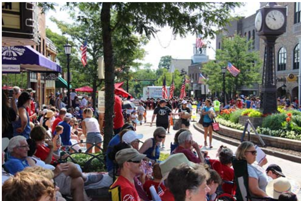
Spectators near Town Square and all along the parade route got an up-close view of the marchers, bands and floats.

Amid sunny skies and near 90-degree weather, the annual Independence Day parade drew residents and visitors from near and far. Check out the photos on the website (posted by end of day on July 5) and on our Facebook page .