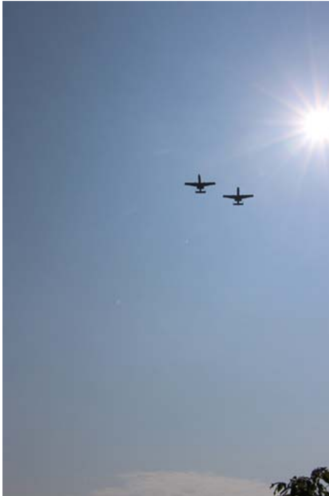
These twin jets flew in the Independence Day parade.

Northville Public Schools has coordinated a military flyover of two A-10 Thunderbolt II (AKA Warthog) jets at 7:04 p.m, Aug. 24, prior to the start of the varsity football game at Tom Holzer Field. If you are attending the game, it will be an added attraction. If you live near the field or are driving by at that time, don't be alarmed by the low-flying jets.