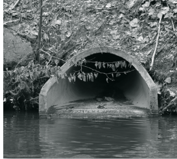
This drainage pipe deposits excess storm water into the Middle Rouge River behind Northville Cider Mill.