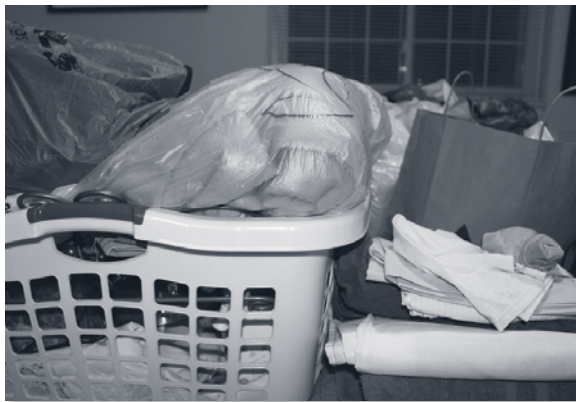
Gather together unwanted clothing and household items and donate or sell them.

For trash collection, make sure you keep the weight in your trash bins to less than 50 pounds. If you are tossing out magazines, catalogues and phone books, put them in your recycling bin in either a paper bag or tie them in a bundle.