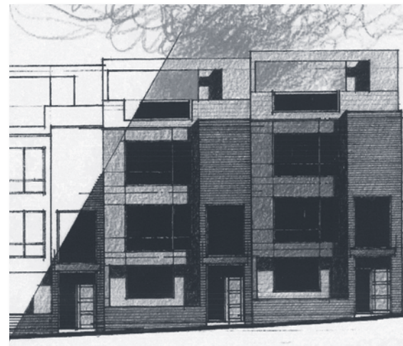
A rendering of the condo unit to be built on Center Street.

Watch for more news about this condo development in City News and on the City’s website.