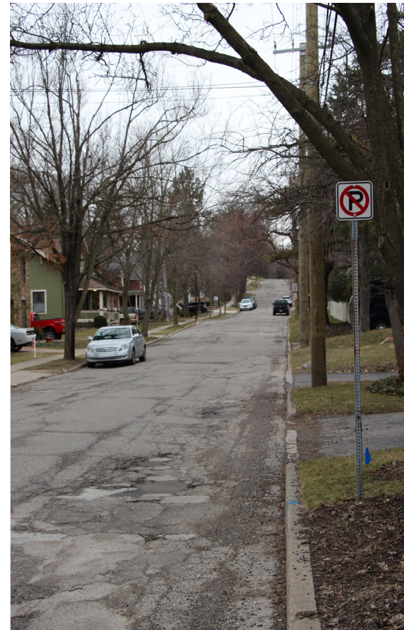
North Rogers Street at Main Street, facing north.