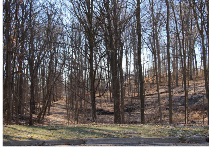
The right of way, showing Horton, which changes from a street into a trail from Maplewood to Hill St.

Horton Street right of way – Two property owners on Maplewood have asked the City to consider a resolution to vacate the right-of-way on Horton, between Carpenter and Novi St. A 400-foot section of Horton (from Hill to Maplewood) had been vacated by the City in September 2018 at the request of area residents. The decision prevents houses from being built along Horton, which now is a trail through the wooded Maplewood Park that extends from Hill to Maplewood. A public meeting on the resolution is slated for the City Council's meeting on Feb. 19.